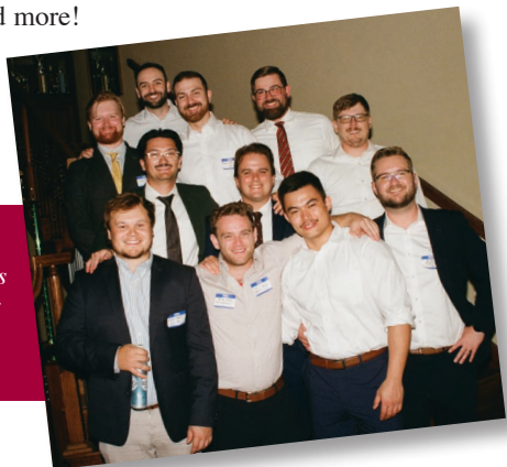
Brothers from the pledge class of 2015 gather for a 10-year reunion.