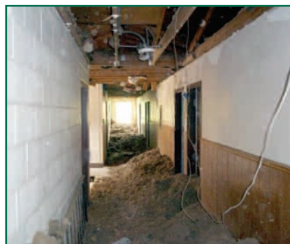
Construction crews have begun demolition in order to renovate and expand 1701 White Columns Drive.