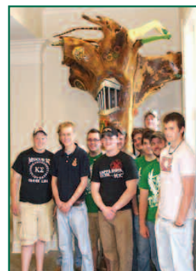
The Chapter took third place with their cudgel in the St. Patrick's Day parade. The 96th annual cudgel was placed in its final resting position at Kappa Sigma International Headquarters.