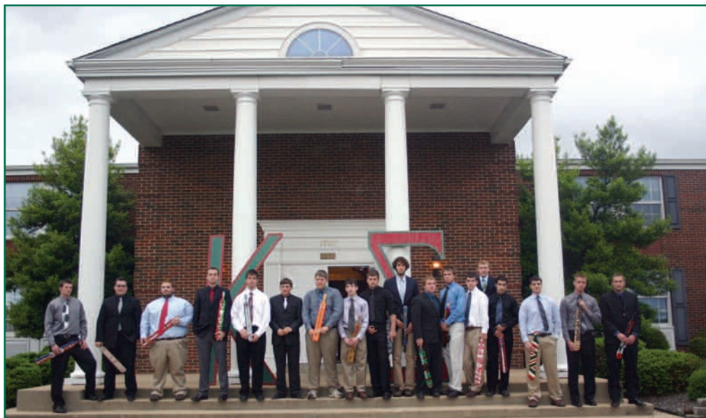
Beta-Chi initiated 21 brothers last fall and three brothers in the spring. The undergraduates will live in downtown Rolla, one half-mile from campus during renovations.

Eleven Beta-Chi representatives traveled to Charlottesville, Virginia, on May 18-20, where