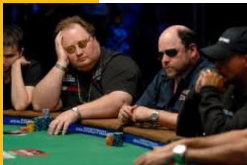
Above: Greg Raymer '83 with Jason Alexander at the 2009 Main Event. Below: Greg wins the 2004 World Series of Poker.