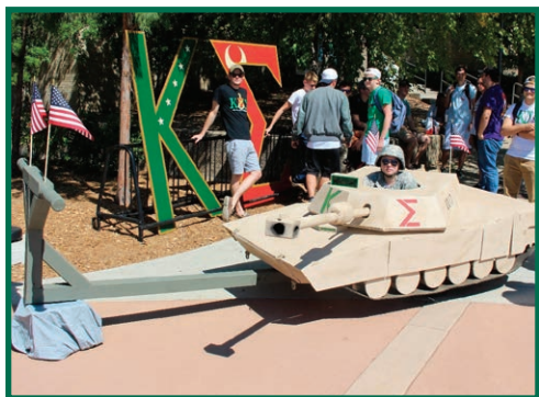
Zach Tognarelli '13 drives the tank for the Greek Week show chariot.

A.E.K.Δ.B., Ryan Howe '14 Grand Master rchqm2@mst.edu