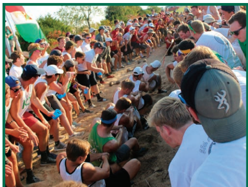
Greek Week's tug of war is a tough competition.