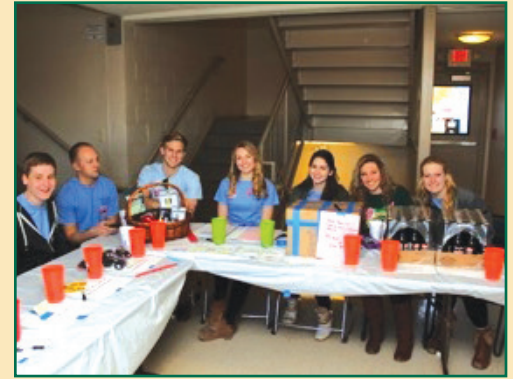
Kappa Sigs and Zetas the raffle table at the 11th annual fish fry.