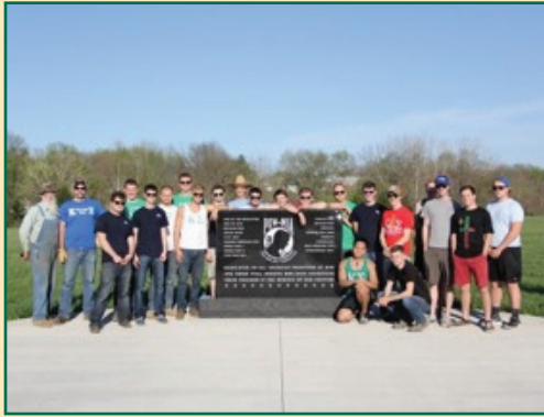
For Kappa Sigma Day of Service, Beta-Chi volunteered at the new Veterans Memorial Park in Rolla.