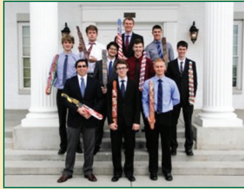
The spring class of 2015 stands on the front steps after being initiated.