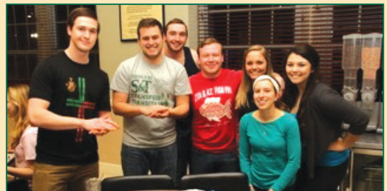
We made baked goods for the fish fry during a social with the ladies of Zeta Tau Alpha.