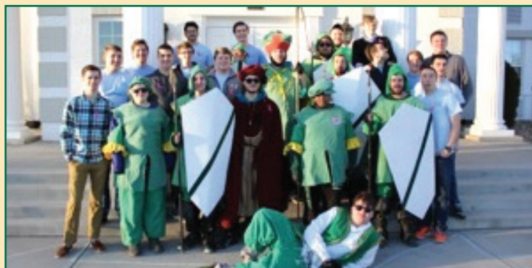
St. Pat's Court stopped by for a visit during our annual fish fry.