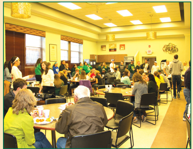
Kappa Sigma and ZTA's annual fish fry event.