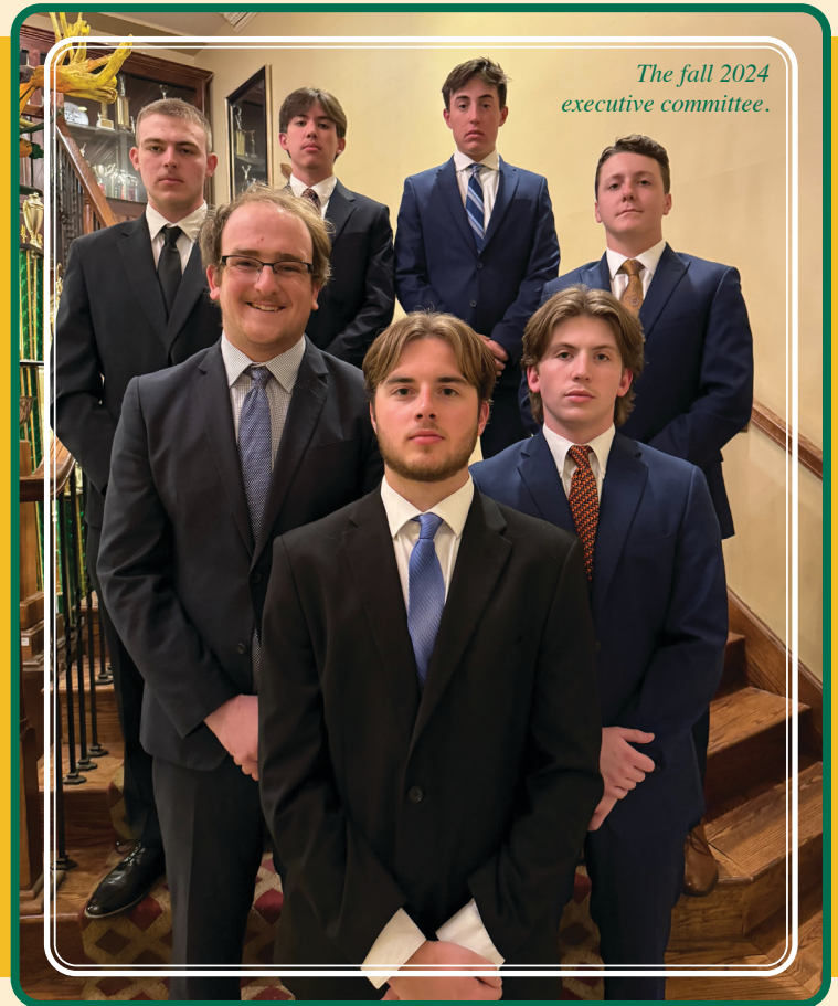
The fall 2024 executive committee.