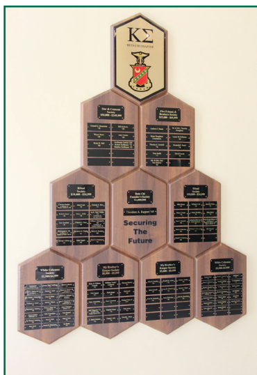
The newly installed plaque recognizes our generous contributors to the Securing the Future campaign.

the process of rebuilding. TKE, Sig Tau, and Lambda Chi are in the planning stages of renovating or building new chapter houses.