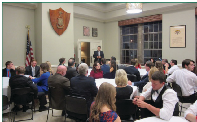
Alumni and actives gathered in the Dining Room during Homecoming weekend.