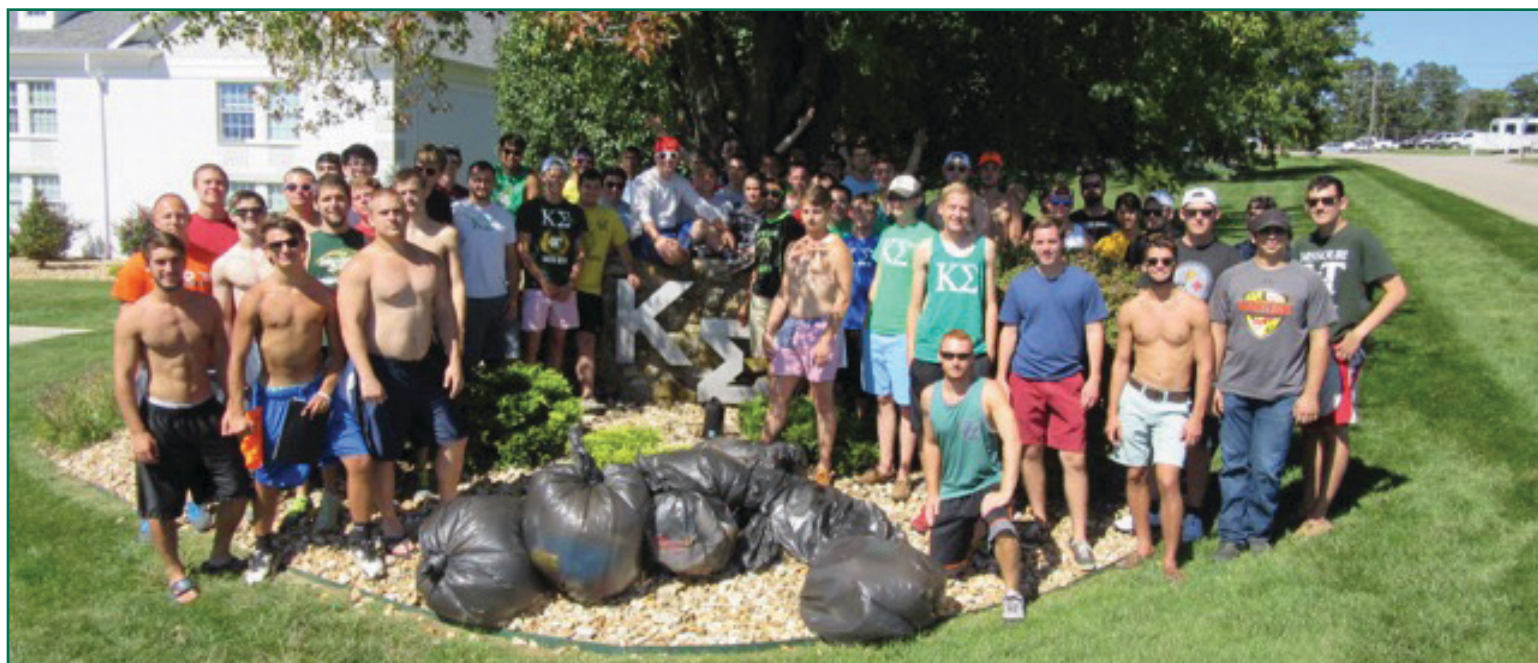
Undergraduates complete a successful White Columns cleanup.