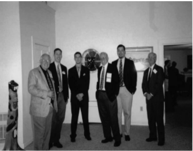
Make your plans now to attend the 100th anniversary of Beta-Chi!

This year, we are planning the 100<sup>th</sup> anniversary and we hope to see an even bigger turnout. The event will take place October 10 and 11. Among the activities that we will be planning include a memorabilia party Saturday at noon. We will also tailgate before the Miner football team takes the field. The main event will take place Saturday evening at the University Center. We will induct 10 brothers into the Beta-Chi Hall of Fame as well as relive memories from the past. Following the ceremony, the chapter will host a 100th-Anniversary party at the