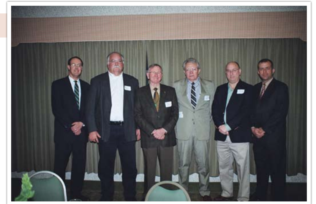
The Class of 2008