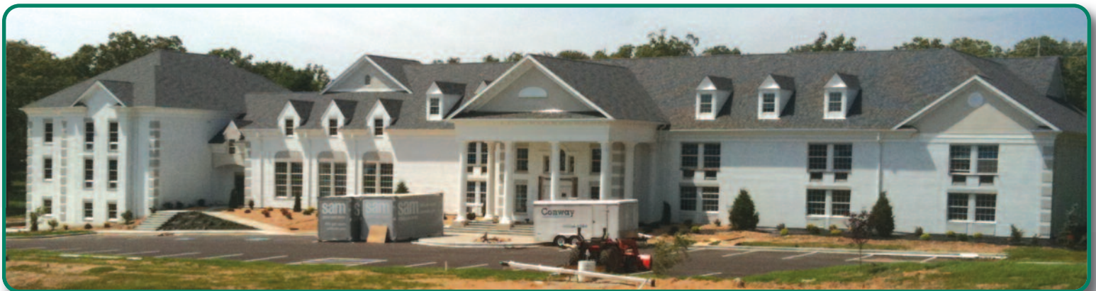
Help us reach our project goal by participating in this $150,000 matching gift challenge!