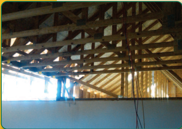
The roof has been raised already and the drywall started in mid-January and parking lots started in November.